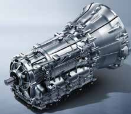
Longitudinal 9 speed automatic