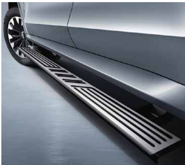
Electric side step