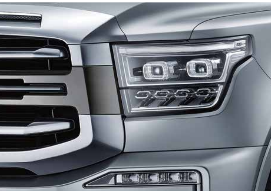
Sober grille + LED split headlamps