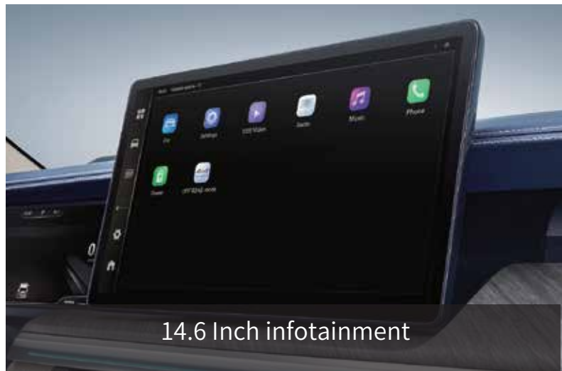
14.6 Inch infotainment