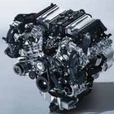
Hi-tech 2.0L HEV