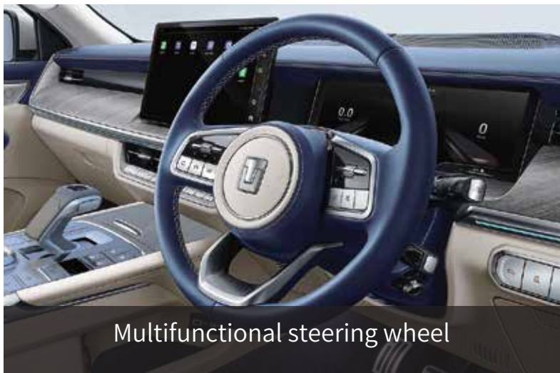
Multifunctional steering wheel