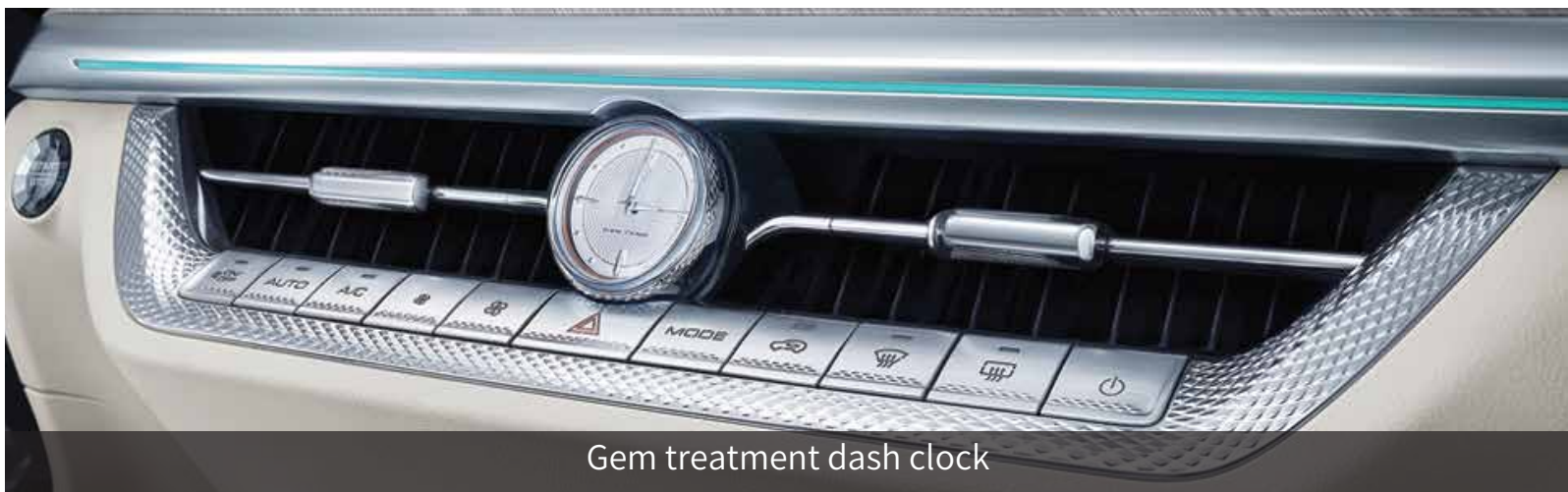
Gem treatment dash clock

Safety on the move. Level 2 driver assistance make every drive an easy one.