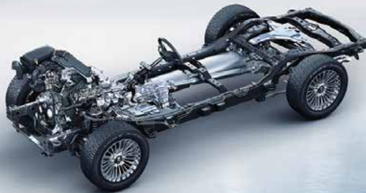
Professional off road suspension and body-on-frame chassis